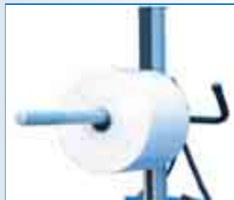
Attachment A-2 is a single ram suited for lifting coils or rolls through the core. The ram length is 24" long and 2" in diameter.