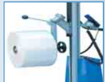
Attachment A-4 is a roll handled designed to handle rolls in the vertical and horizontal position (poker chip position). The unit features an expandable ram that holds the roll by expanding in the core and turning the wheel pictured. The ram is 11" long and is 2.9" in diameter.