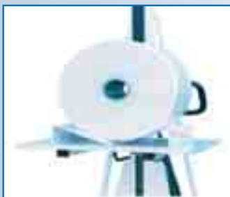
Attachment A-1 is used for rolls or coils that require lifting from underneath. Ideal for placing rolls on and off a shaft.