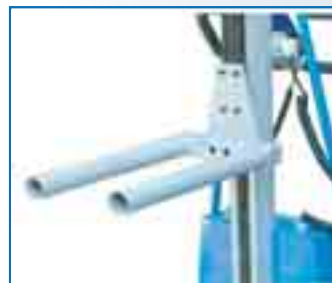
Attachment A-3 is a dual ram arrangement. The ram length is 17.75" long and 2" in diameter. The distance between the rams is 6". It can be used to cradle rolls or can handle two small rolls at one time through the core.