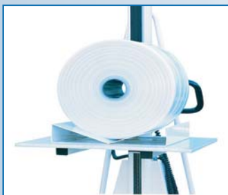
Attachment A-1 is used for rolls or coils that require lifting from underneath. Ideal for placing rolls on and off a shaft.