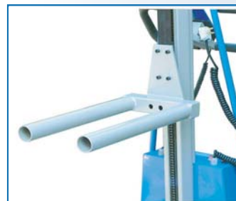
Attachment A-3 is a dual ram arrangement. The ram length is 17.75" long and 2" in diameter. The distance between the rams is 6". It can be used to cradle rolls or can handle two small rolls at one time through the core.