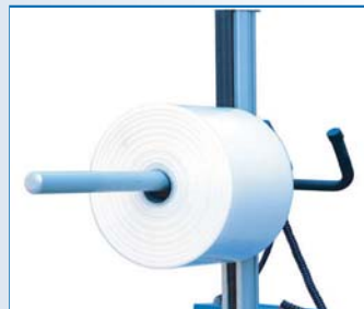
Attachment A-2 is a single ram suited for lifting coils or rolls through the core. The ram length is 24" long and 2" in diameter.