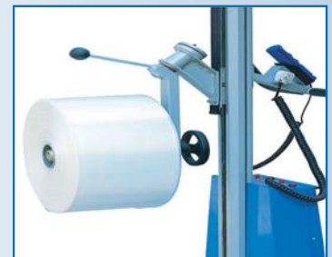
Attachment A-4 is a roll handled designed to handle rolls in the vertical and horizontal position (poker chip position). The unit features an expandable ram that holds the roll by expanding in the core and turning the wheel pictured. The ram is 11" long and is 2.9" in diameter.