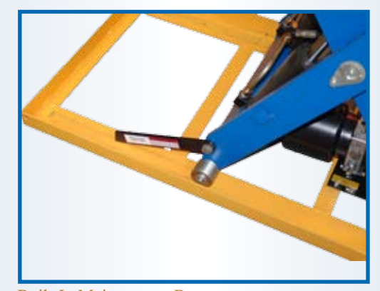
Built-In Maintenance Bar