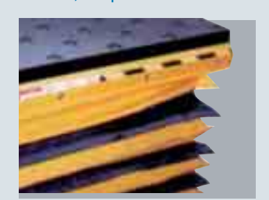
Accordion Safety Skirting