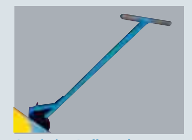
Semi-Live Dolly Jack