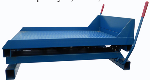
9" Lowered Height