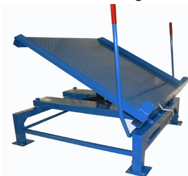
Adjustable Raised Base (Fixed Raised Base also available)