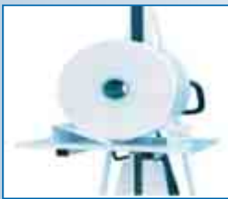
Attachment A-1 is used for rolls or coils that require lifting from underneath. Ideal for placing rolls on and off a shaft.