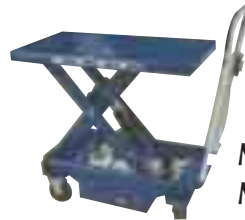
Model No. MMLE-100