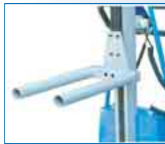
Attachment A-3 is a dual ram arrangement. The ram length is 17.75" long and 2" in diameter. The distance between the rams is 6". It can be used to cradle rolls or can handle two small rolls at one time through the core.