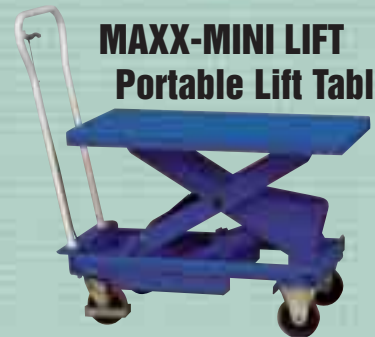
MAXX-MINI LIFT Portable Lift Table