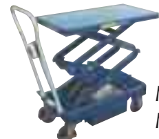
Model No. MMLE-50D