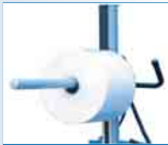
Attachment A-2 is a single ram suited for lifting coils or rolls through the core. The ram length is 24" long and 2" in diameter.