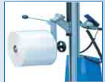
Attachment A-4 is a roll handling attachment designed to handle rolls in the vertical and horizontal position (poker chip position). The unit features an expandable ram that holds the roll by expanding in the core and turning the wheel pictured. The ram is 11" long and is 2.9" in diameter.