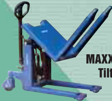
MAXX-MOBILE Tilt & Lift