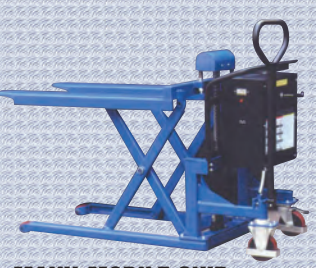
MAXX-MOBILE SKID LIFTER Manual & Electric