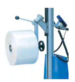
Attachment A-4 is a roll handling attachment designed to handle rolls in the vertical and horizontal position (poker chip position). The unit features an expandable ram that hold the roll by expanding in the core and turning the wheel pictured. The ram is 11" long and is 2.9" in diameter.