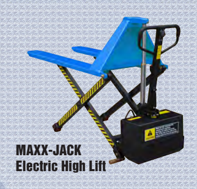
MAXX-JACK Pallet Truck