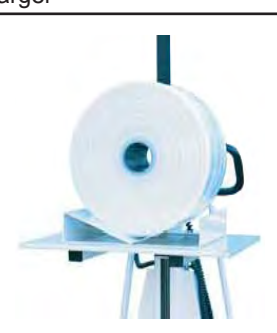
Attachment A-1 is used for rolls or coils that require lifting from underneath. Ideal for placing rolls on and off a shaft.