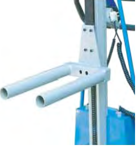
Attachment A-3 is a dual ram arrangement. The ram length is 17.75" long and 2" in diameter. The distance between the rams is 6". It can be used to cradle rolls or can handle two small rolls at one time through the core.