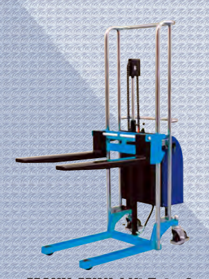
MAXX-MINI-Lift Tote & Platform Lift Electric