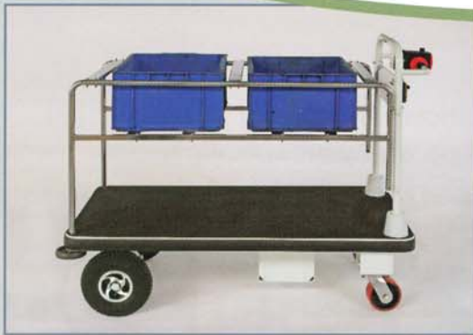
Moto-Cart Jr. Tote Rack