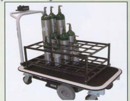
Moto-Cart with Optional Oxygen Cylinder Rack Top holds 28 C, D or E size cylinders. Polyethylene coated to protect cylinders and prevent noise. Designed as an option to our standard MC-10-S unit.